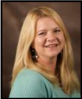
By Kelli Stoops Kingdom Kids Director

October was such a fun month to learn about fall and color changes. The three and four year old classes had an exciting field trip to the Pumpkin Express and we all want to thank our parents for taking time out of their busy day to drive and help chaperone us. Everyone