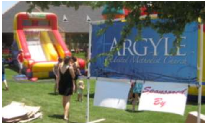
The Country Lakes community in Argyle held its annual Summer Kick Off in conjunction with Public Safety Day, sponsored by the Country Lakes HOA and Argyle Police and Fire Departments on June 5th. Argyle United Methodist Church sponsored the Giggly Kids games and bounce houses.