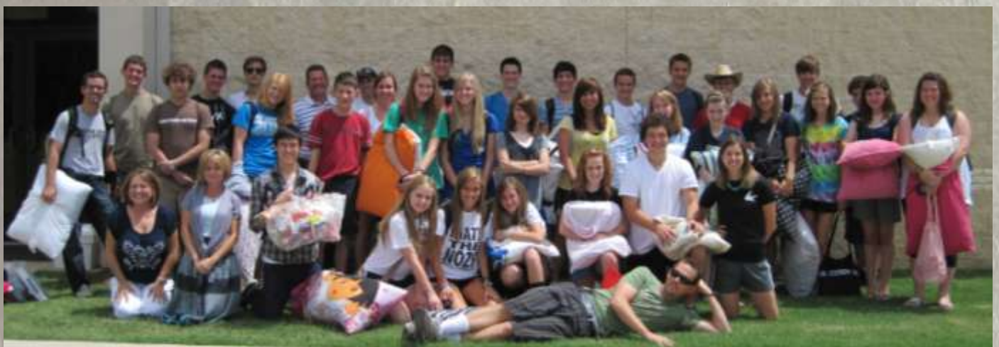
Thank you for praying for our students as they completed mission work in Westmoreland, TN.